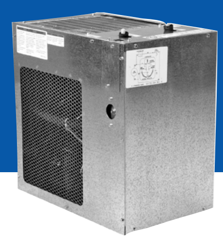
SMC30 and SMC45

SMC30 and SMC45 models offer a 5-year limited warranty. SMC4 offers a 1-year warranty.